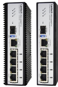
12V model 48V model